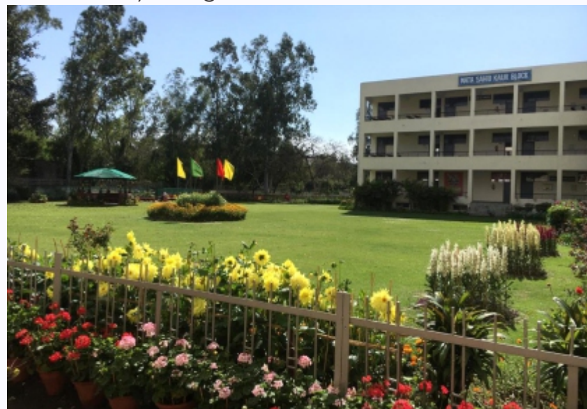
Best Maintained Campus in Chandigarh since 2008